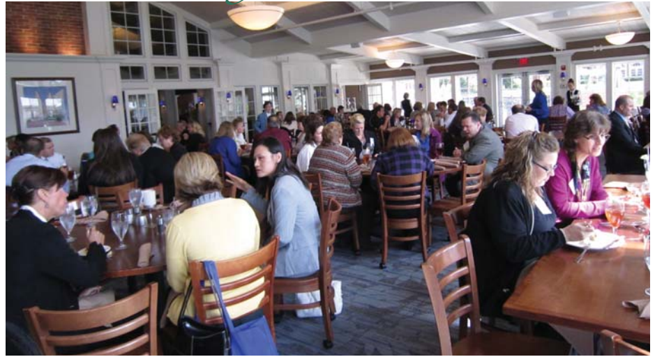
Conference Networking Luncheon